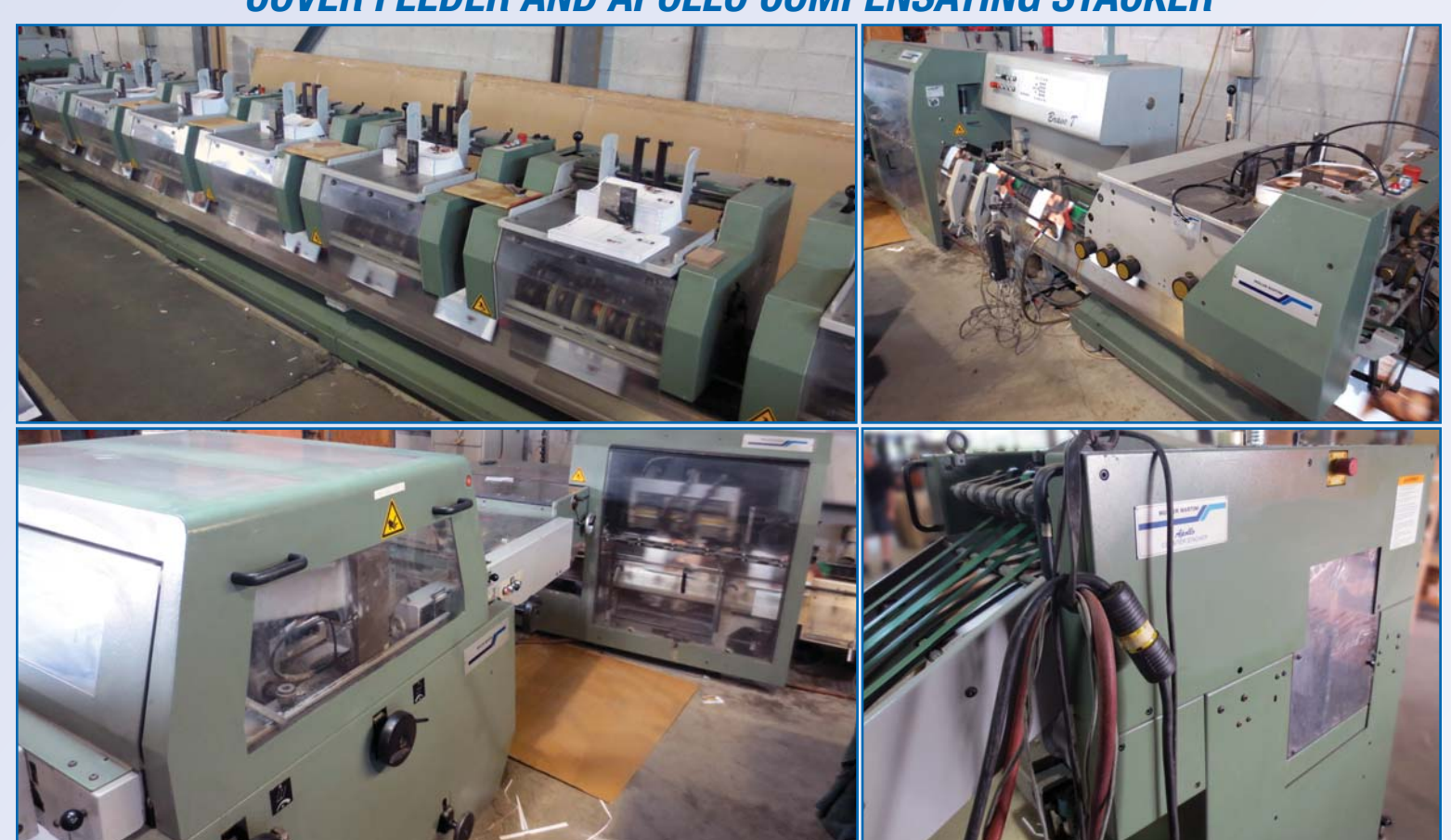
1992 MULLER 321 FOX (6) POCKET SADDLESTITCHING LINE WITH COVER FEEDER